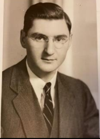
Our Pastor 1935 - 39