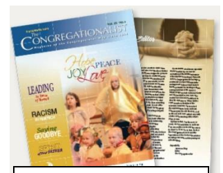
Congregationalist 1849 -