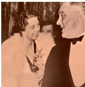
President Franklin and First Lady Eleanor

His later achievements were varied. He had a radio show, stayed active in youth programs coordinating eight overseas youth assemblies! He was one of the founders of the National Association of Congregational Christian Churches. He participated in the merger of the Congregational and Evangelical Reformed Church which then formed the UCC! He became national publication editor of the Congregationalist which promotes the “Congregational Way.” He wrote a bestseller The Upward Call . His national work brought him in contact with President Franklin and First Lady Eleanor Roosevelt. The Country was beginning to